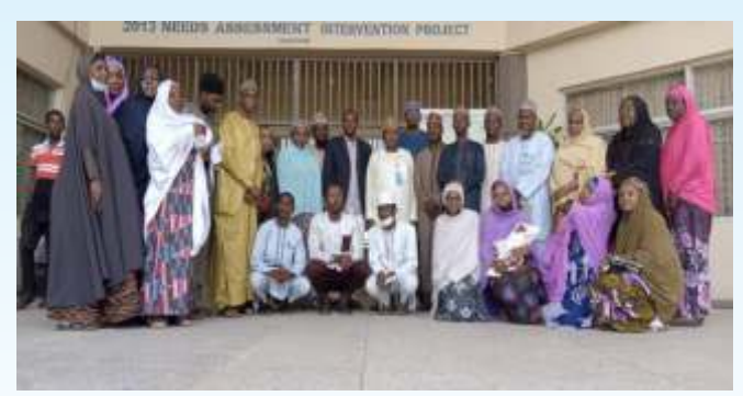
Students on SIWES from SCE, BUK

During the second quarter, students from School of Continuing Education, Bayero University, Kano completed their Industrial Training with the University Library. The University Librarian commended the participants for their hard work, punctuality and discipline.