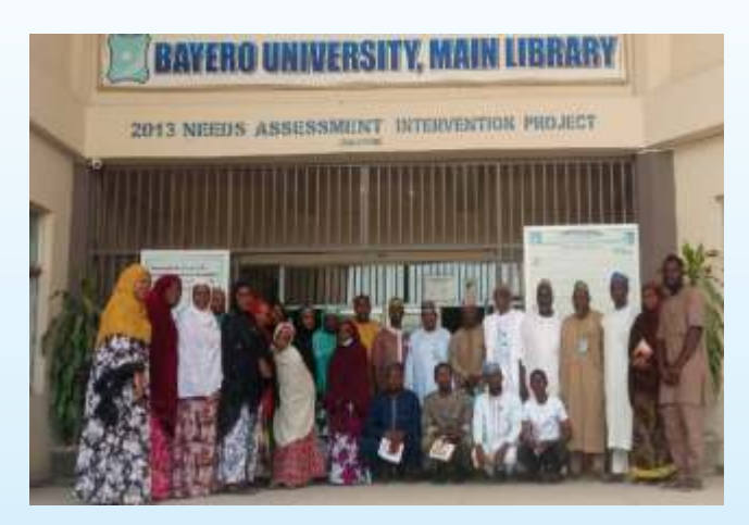
Students on SIWES Program from SCE, BUK

The University Library received SIWES students from the School of Continuing Education, Bayero University, Kano on 6<sup>th</sup> May 2021. As a tradition, the students alongside other existing SIWES students from within and outside the University will receive rigorous and outstanding training and field experience from the Library.